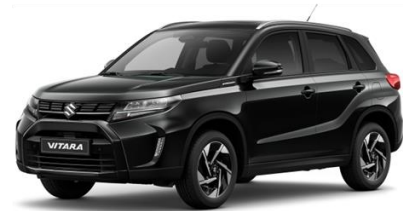
Cosmic Black Pearl Metallic