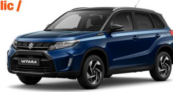
Sphere Blue Pearl Metallic / Cosmic Black