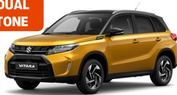
Solar Yellow Pearl Metallic / Cosmic Black