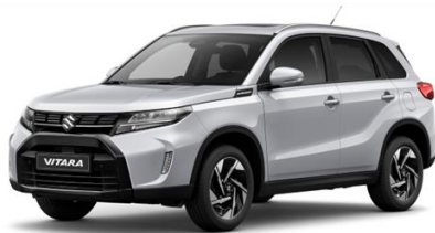
Silky Silver Metallic