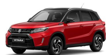
Bright Red / Cosmic Black