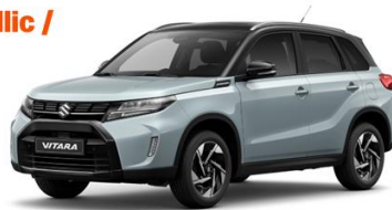
Ice Greyish Blue Metallic / Cosmic Black