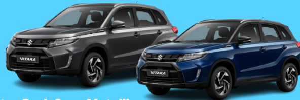
Titan Dark Grey Metallic single tone