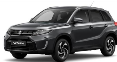
Titan Dark Grey Metallic