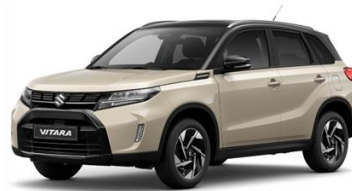
Savanna Ivory Metallic / Cosmic Black